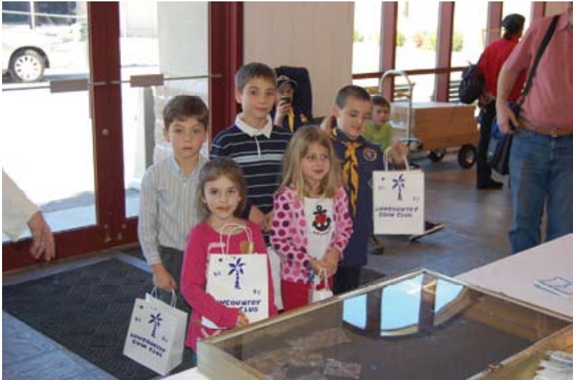
YN waiting to receive treats at the show.