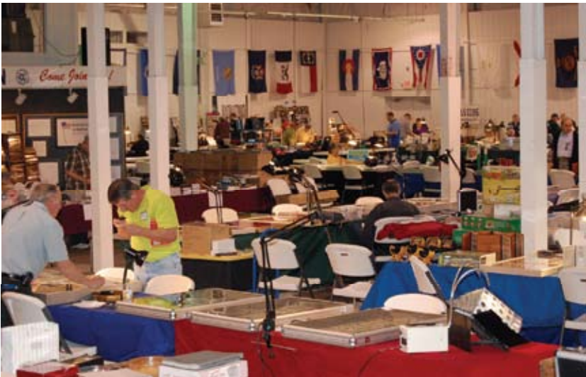
Views of Bourse Floor.