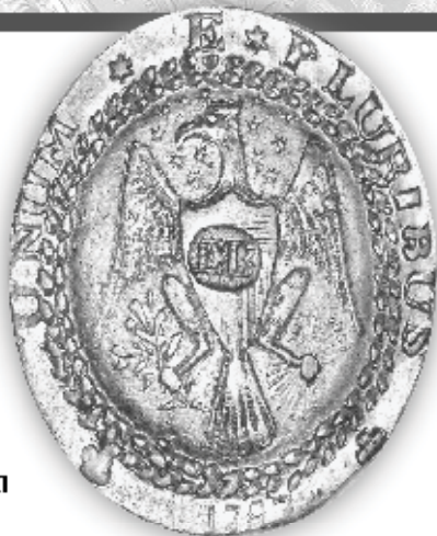
Unique 1787 "68" on board Brother Dobson from the Gold Rush Collection